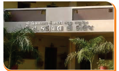
Law College Himmatnagar