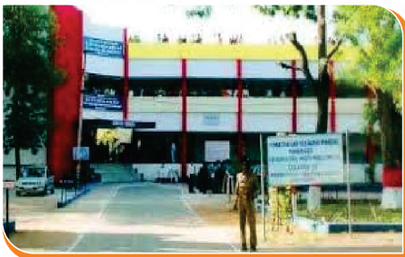
S. S. Mehta Arts & M. M. Patel Commerce College, Himmatnagar