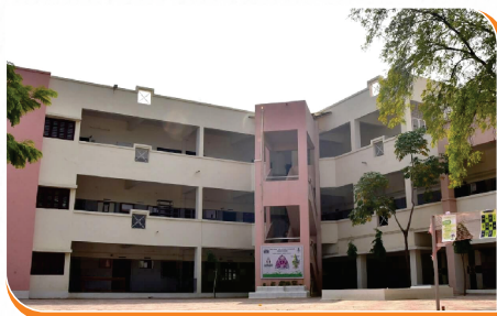
The HNSB. Ltd. Science College, Himmatnagar